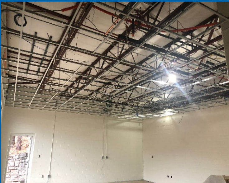
North Building Ceiling Grid Installation