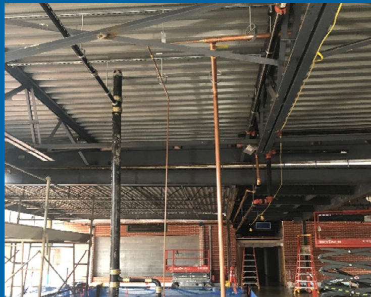
Gymnasium Addition MEP OH Rough