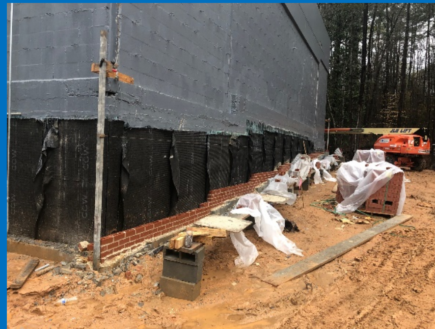
Brick Starting at Gymnasium North Elevation