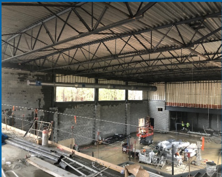
Spiral Duct Installation at Gymnasium