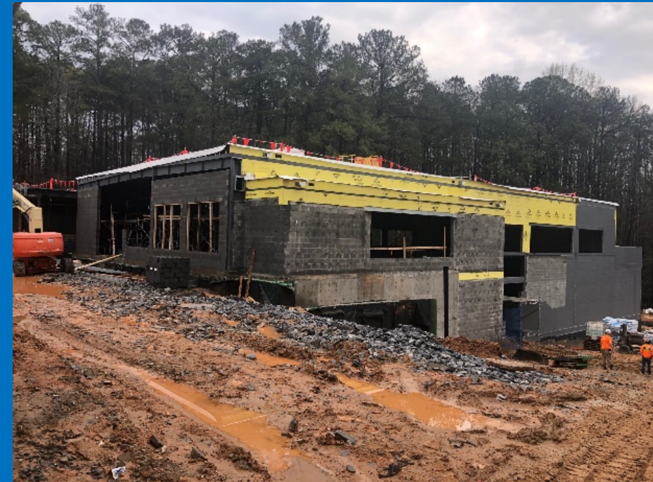
Gymnasium Addition (South East)