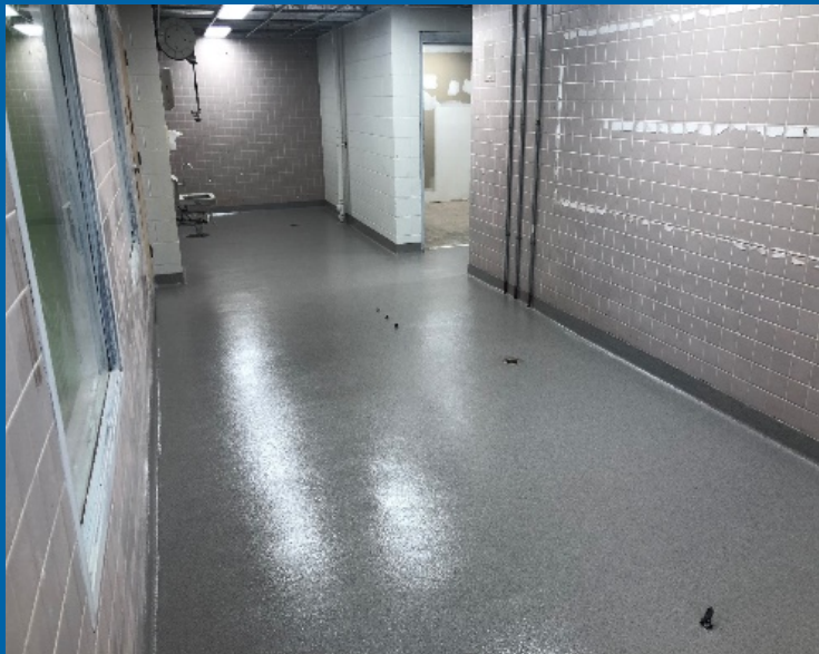
Kitchen Epoxy Flooring Complete