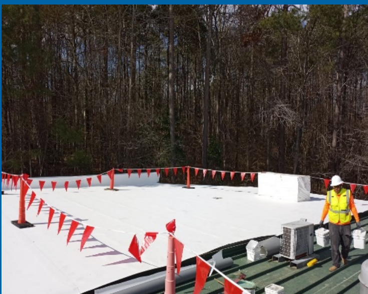
North Building TPO Roofing Replacement